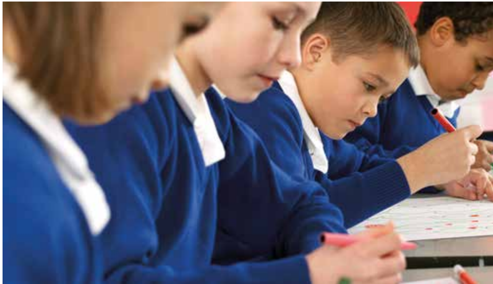
Progress scores in 2013 and 2014

difficulty of every question across all the tests. The models are complicated but their aim is simply to make it possible to measure improvement in reading and numeracy from one year to the next. It will also be possible to investigate whether standards in reading and numeracy across the whole country change over time. As long as your child takes the tests each year, you will be able to track their progress as measured by the tests.